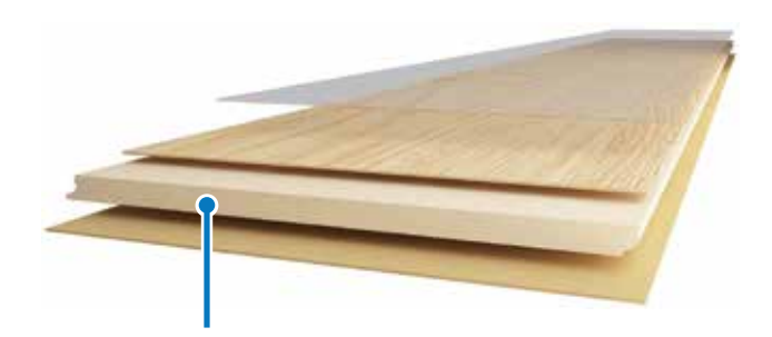
Specialised treatment in the core

Independent test certified for T-Seam - Swell & Seepage > 80hrs.