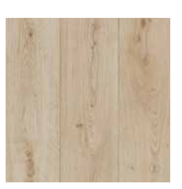
Alpine Mist 🔵