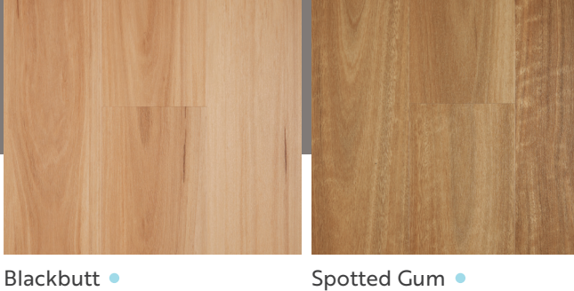
1520 x 228 x 7.5MM, 2.080M<sup>2</sup> / CTN